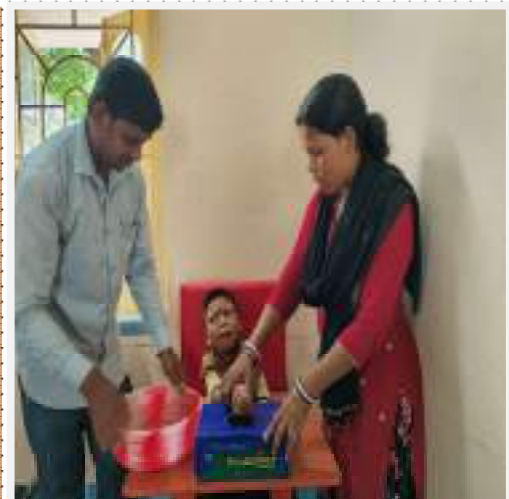
Day Care Camp: Physical Development Activities to Children with Cerebral Palsy at Pandua