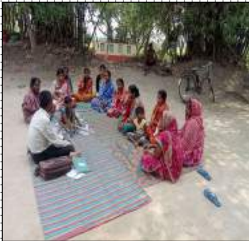
Community Awareness Programme organized at Mondolai Village of Pandua Block (Mahir Paramanick – HI)