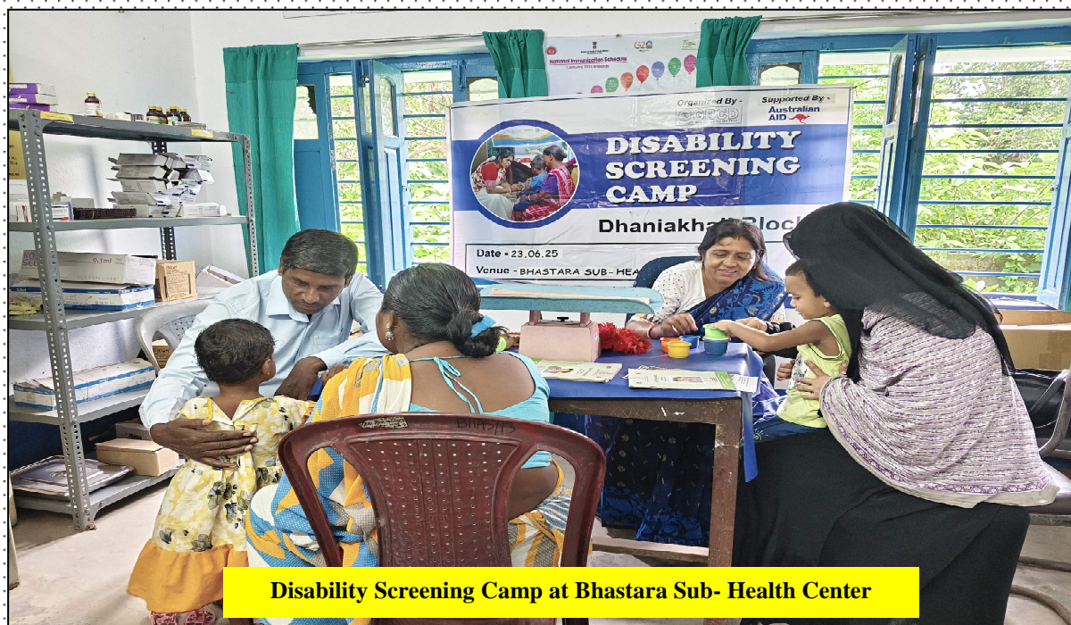
Disability Screening Camp at Bhastara Sub- Health Center