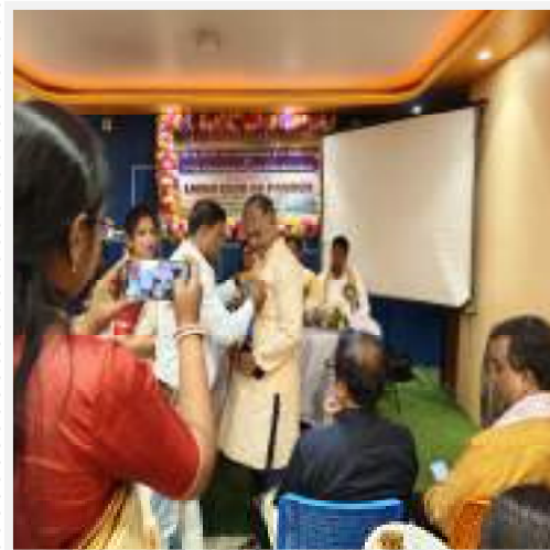
Felicitation to Director of GBOD by Lions Club Pandua