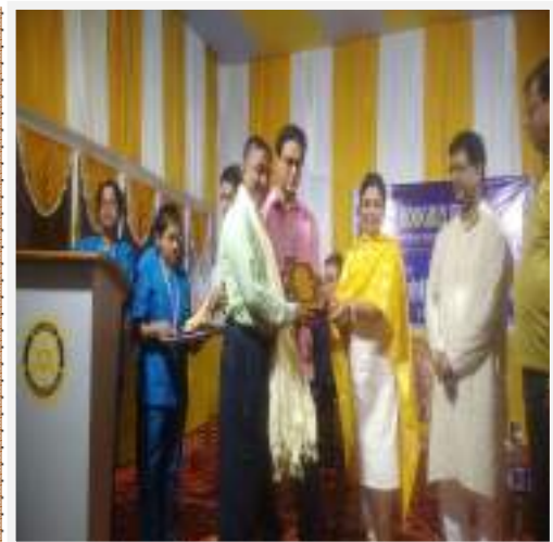
Felicitation to Director of GBOD by Rotary Club Hooghly