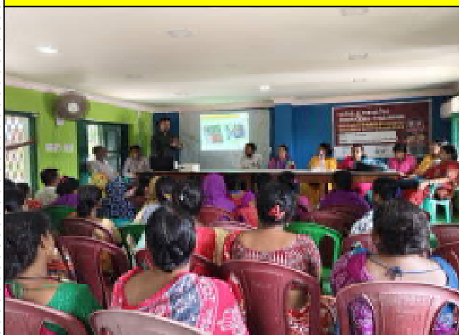
ICDS & Health Workers Training at G. Malipara GP