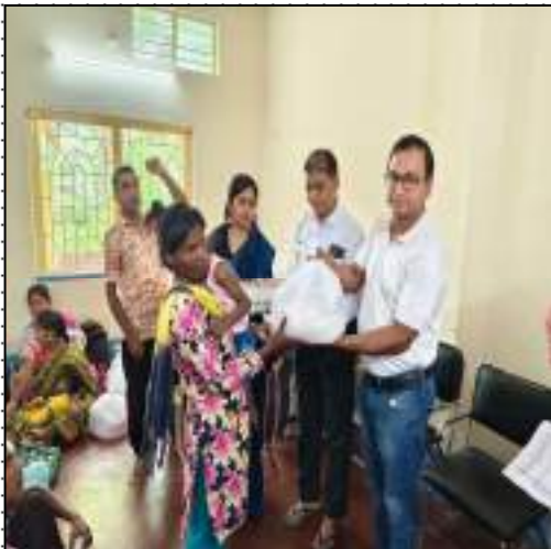
Nutritional Food distributed to 40 malntrate CwDs