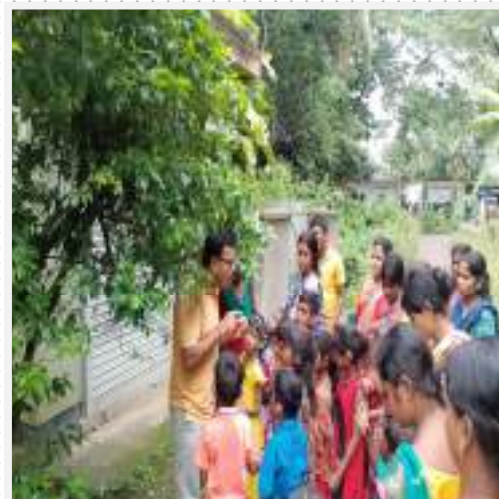
Day Care Camp : Concept of Tree to Children with Hearing Impairment at Dadpur BLRC