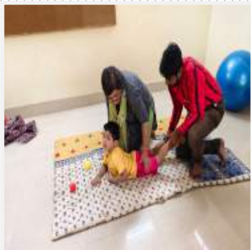
Occupational Therapy for Children with Autism Spectrum Disorder (ASD) at Head Office