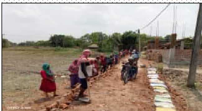
Parents group Preparing Entrance Road at Dhaniakhali BLRC