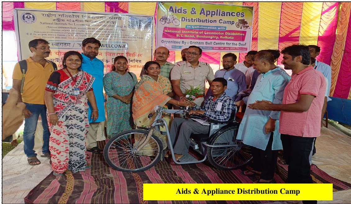
Aids & Appliance Distribution Camp