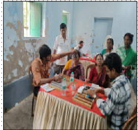
Eye Check-up Camp at Boinchigram Village of Pandua Block