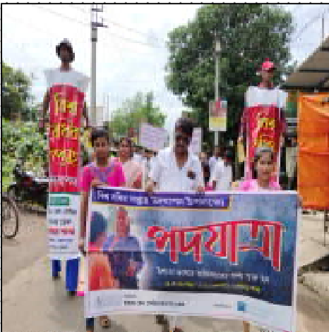
Awareness Rally at Balagarh Block