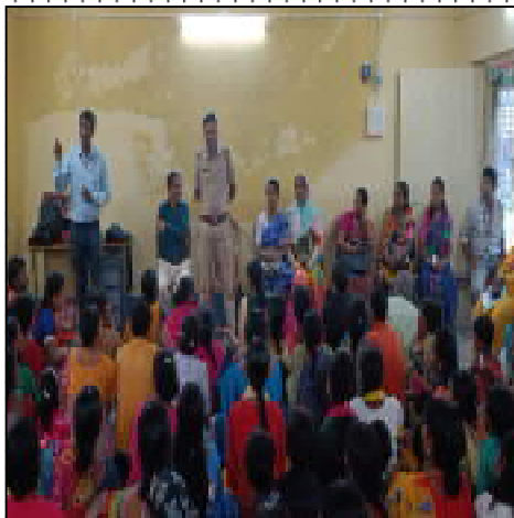
Speech by SI of Polba Police station at Polba BLRC