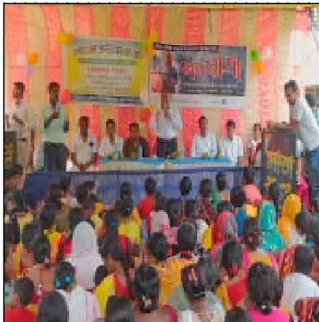
Speech by honorable Director of GBCD about Deaf Week