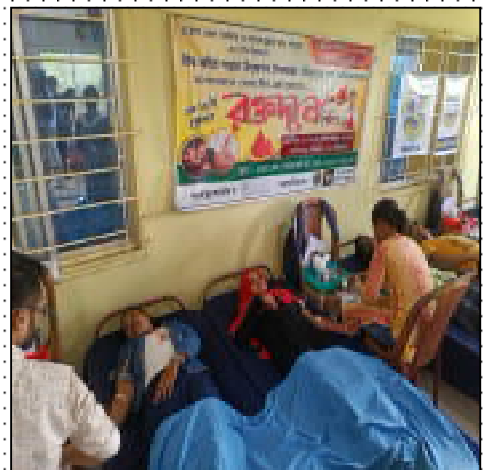
Blood Donating by Deaf Adults (Girl)