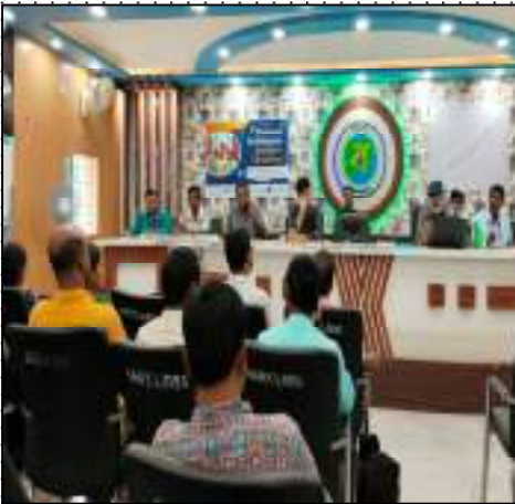
Teachers Training on Inclusive Education at Bhastara GP Meeting Hall of Dhaniakhali Block