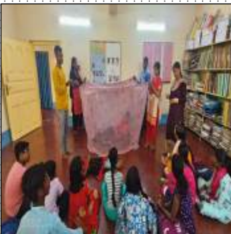
Demonstration on 'Dengue Safety' during short stay camp