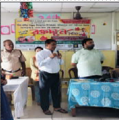
Inaugural speech by honorable director of Blood Donation Camp at GBCD Head Office