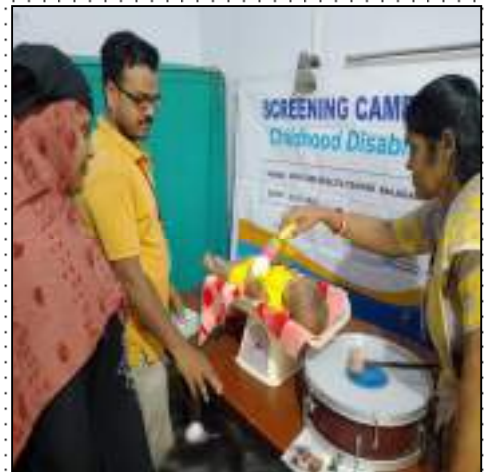
Childhood Disability screening camp organized at AIDA Sub-health center of Balagarh Block.