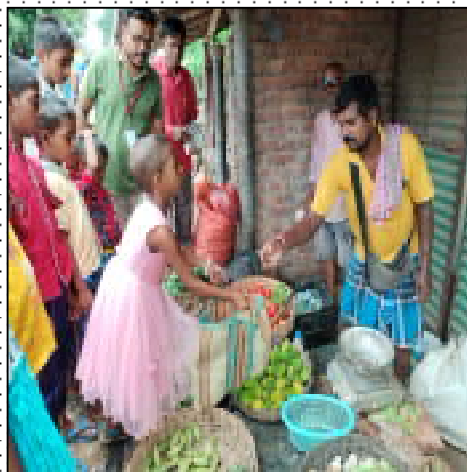
Demonstration on Market Concept during short stay camp