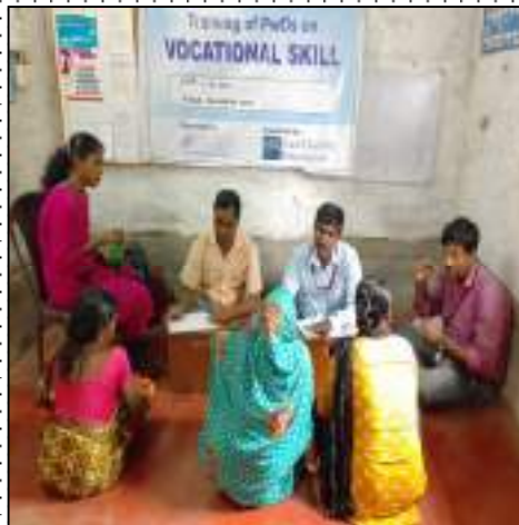
PwDs Training on Vocational skill organized at Balagarh BLRCBLRC