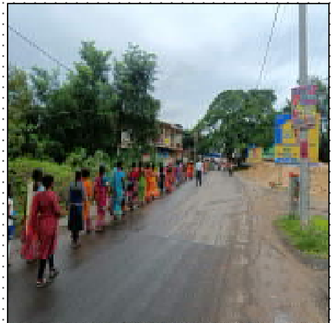
Awareness Rally at Dhaniakhali Block