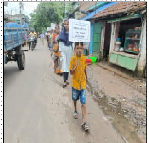
Awareness Rally at Polba-Dadpur Block