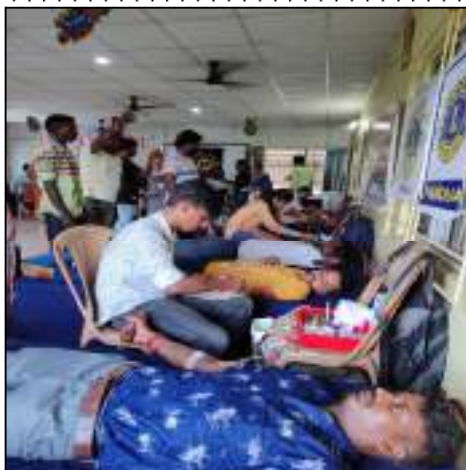
Blood Donating by our Deaf Adults (Boys)