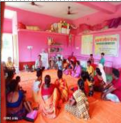
Parents Training on Rights & Entitlements of CwDs organized at Dhaniakhali BLRC