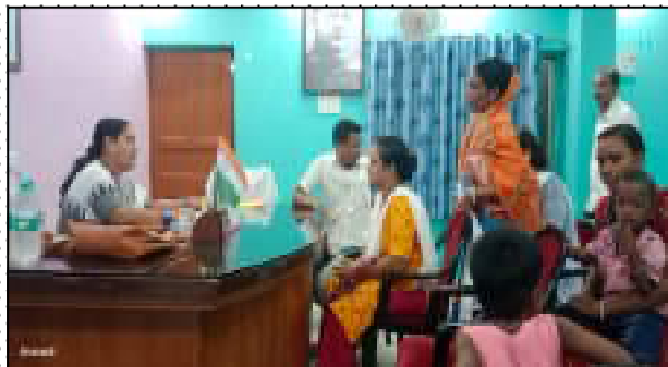
Parents are advocating for their rights at BDO Office