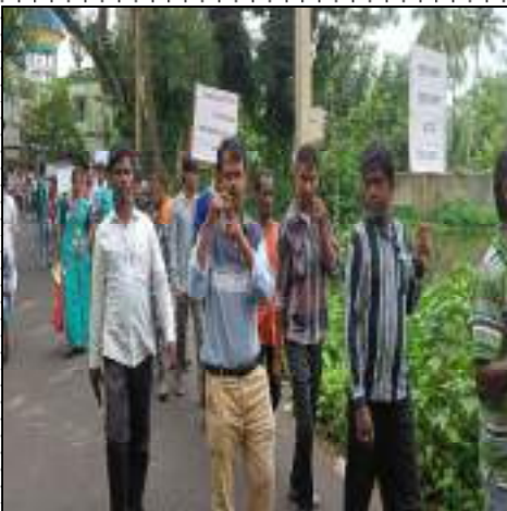
Our DRM promoting Indian Sign Language at Puinan BLRC