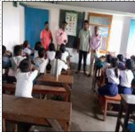
Classroom Demonstration programme on deaf teaching methodology at Kanui Banka Primary School